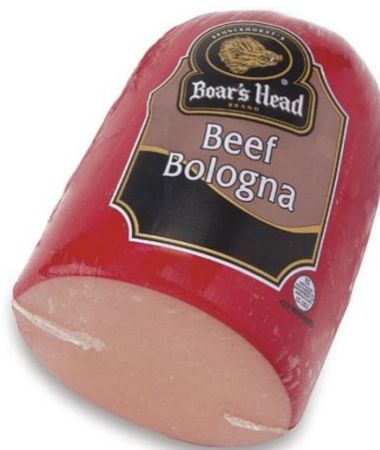
Boar's Head Beef Bologna