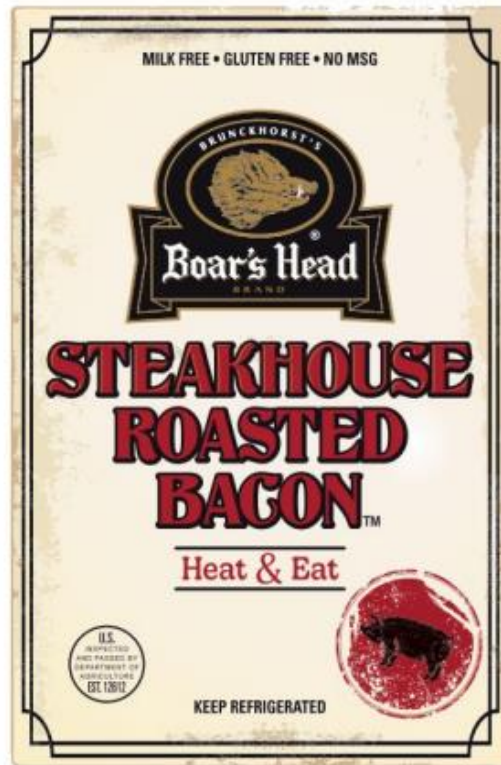
Boar's Head Steakhouse Roasted Bacon Heat and Eat